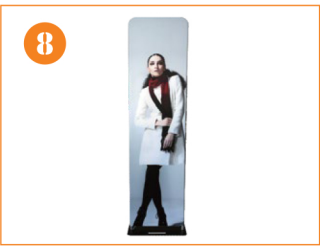
8. Completed Inteliframe with graphic.