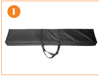
1. Snello black padded bag.