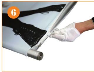
6. Zip the bottom of the graphic.