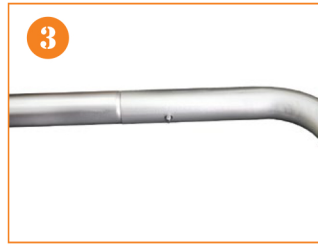
3. Arrange and assemble the frame by connecting the tubes together.