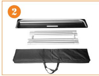
2. Take out the parts of the frame from the bag.