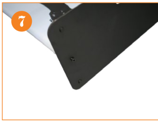
7. Attach base with provided screws.