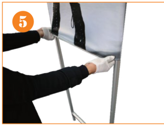
5. To install the graphic, slide the graphic from the top of the frame towards the bottom.